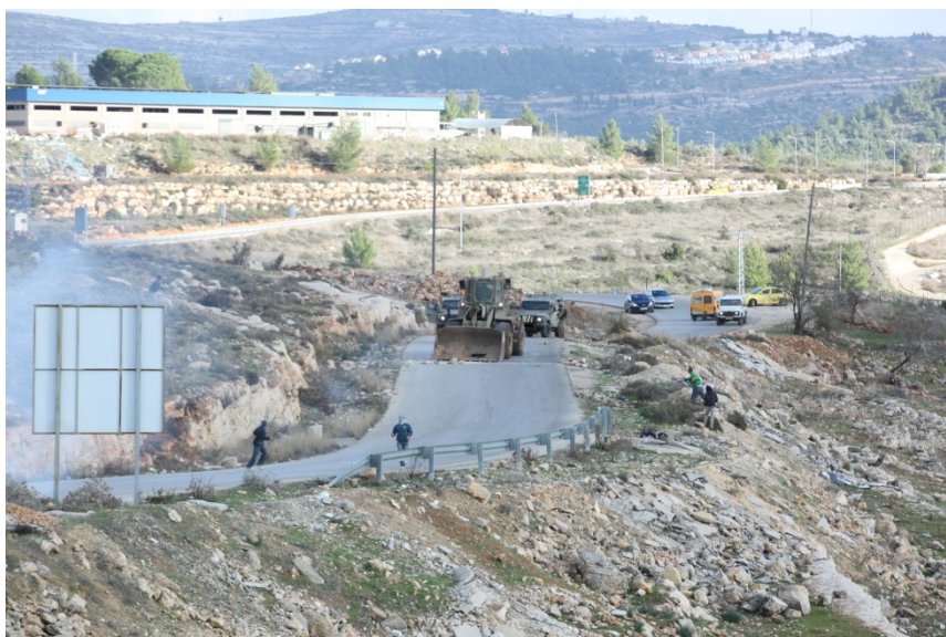
Screenshot from the video footage taken by David Reeb, 04:30