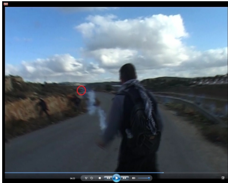
Screenshot from the video footage taken by David Reeb, 04:55