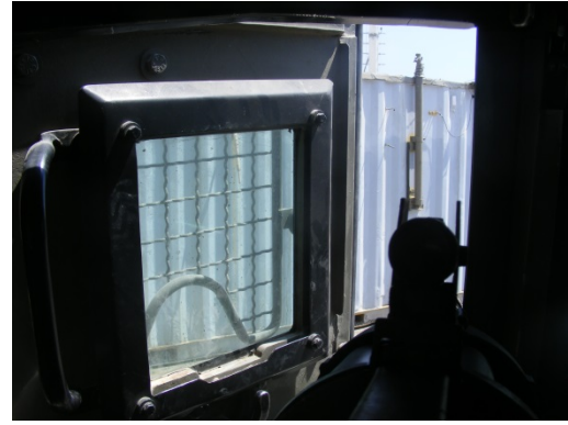
Photos DSCF515 (left) and DSCF506 from the series of photos of the jeep's structure taken during the reenactment of the incident and later also used in preparing the opinion.