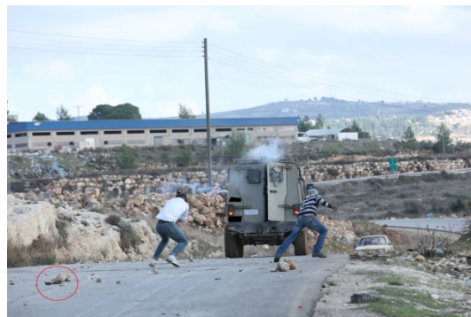
Sequence of photographs IMG_7556 through IMG_7560