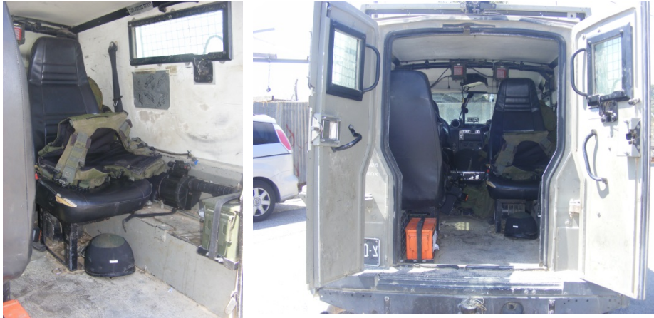
A.'s seat, photos DSCF500 and DSCF499, from the series of photos of the jeep's structure taken during the reenactment of the incident and later also used in preparing the opinion.