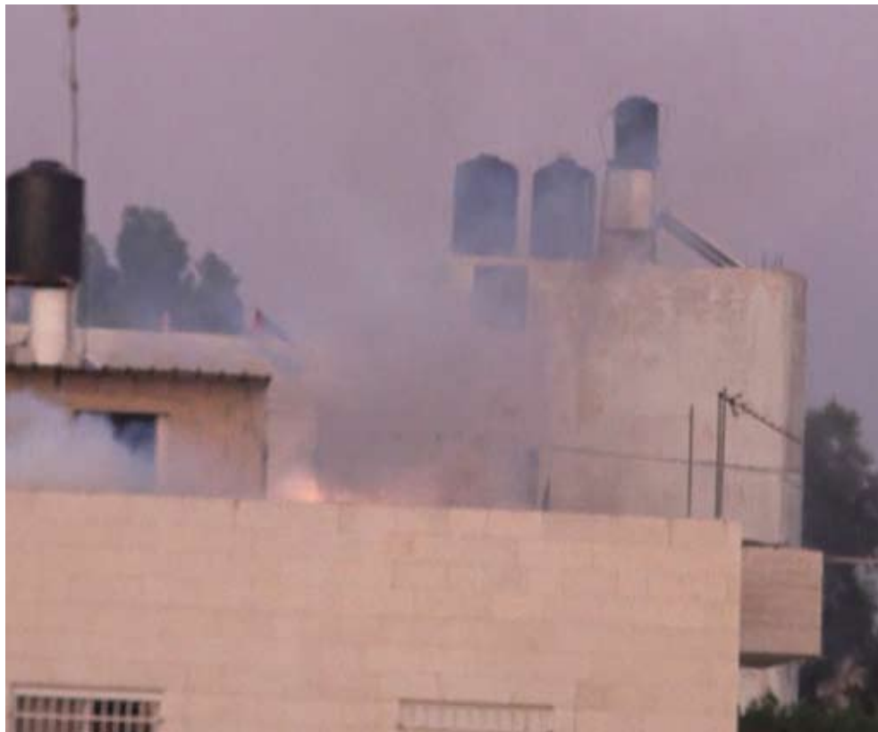
House in a-Nabi Saleh clouded in tear gas, 15 July 2011 (Bilal Tamimi)

B'Tselem documented, security forces often fired tear-gas canisters directly; at the demonstration on 13 May, two demonstrators were wounded as a result of direct firing of tear-gas canisters. 21