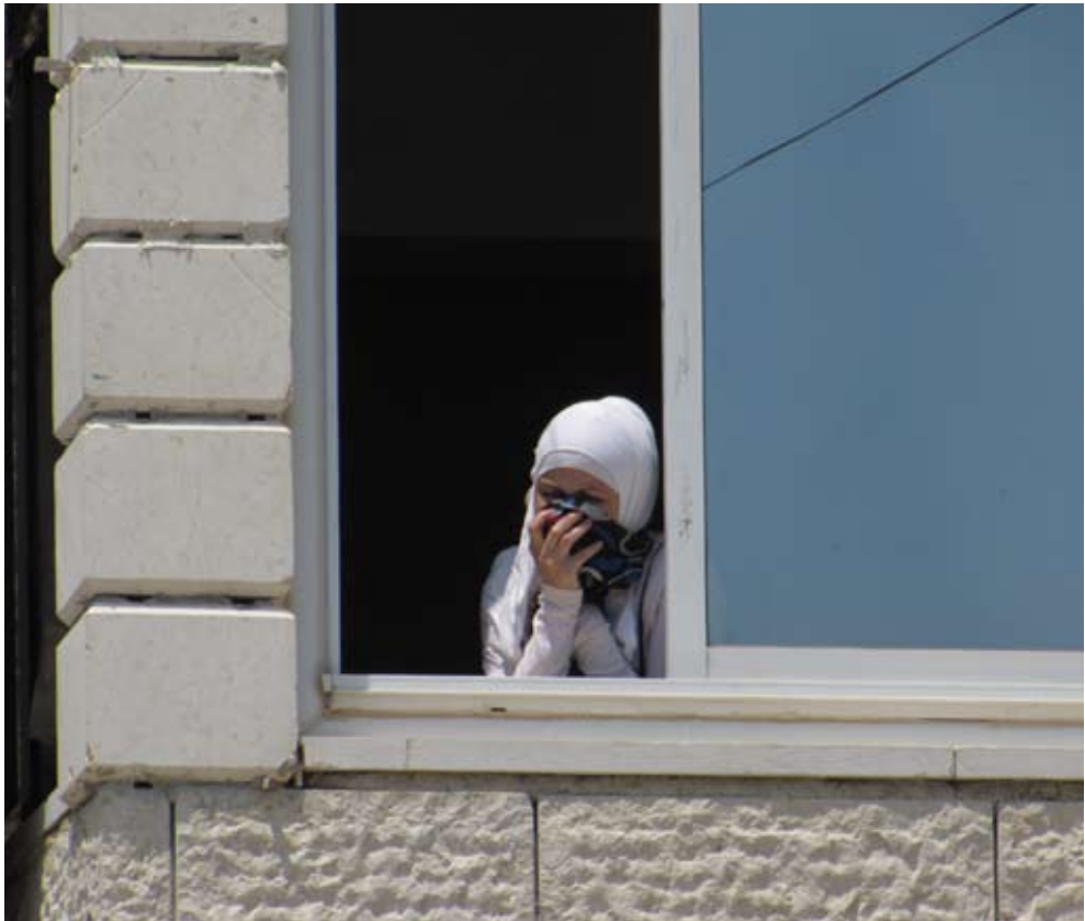
The tear gas reaches the homes

Security forces prohibit demonstrations outside the village, so they are held between the houses of the village. Consequently, all the residents, even those not participating in the demonstration, are affected by the crowd-control measures used. The entire village, including the elderly, children, ill persons, and pregnant women, are exposed weekly to large quantities of tear gas, from which they have no place to flee. The residents generally remain in their homes, so the immediate effect of the tear gas is felt for many minutes. In some cases, anybody who leaves the house is met with another round of gas.