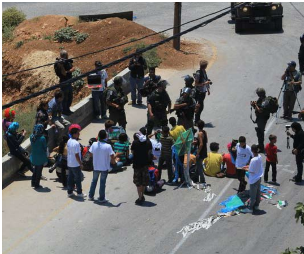
Children of a-Nabi Saleh, in costumes and with kites, in a procession, 24 June 2011

In the first three demonstrations that B'Tselem documented, security forces dispersed the procession as soon as it began, but demonstrators then managed to hold a limited demonstration near the intersection at the entrance to the village. In the fourth one, on 8 July, security forces prohibited any gathering at all.