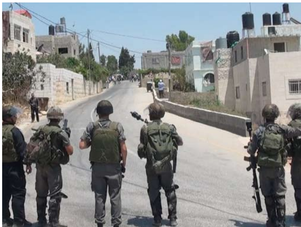
Soldiers waiting to disperse the procession, 15 July 2011 (Bilal Tamimi)

declared an “unlawful assembly” immediately at the start, and army officials told the demonstrators that the area was a closed military area. The declaration was made even though the demonstrators had committed no violent act and were still 50-100 meters from the security forces. In the demonstration on 24 June, security forces also declared a gathering of children in costumes and flying kites “an unlawful assembly” before the main procession began.