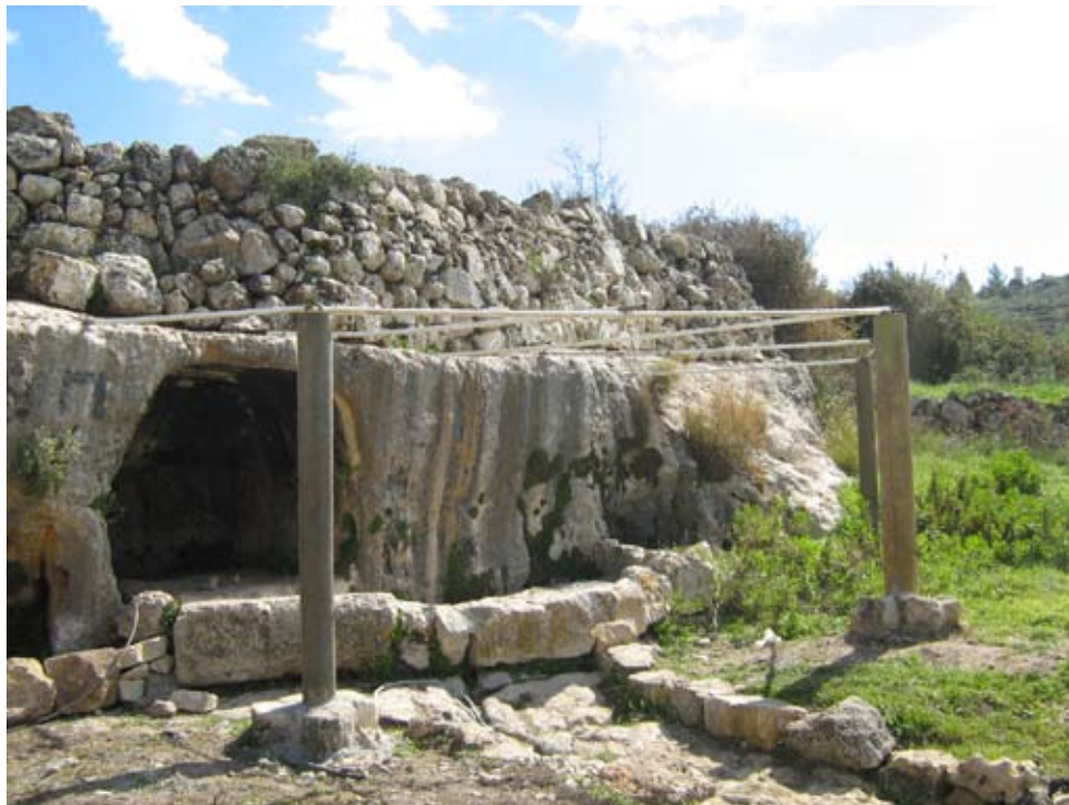
Start of the renovation work at al-Qaws Spring (Iyad Hadad, B'Tselem, 16 February 2009)