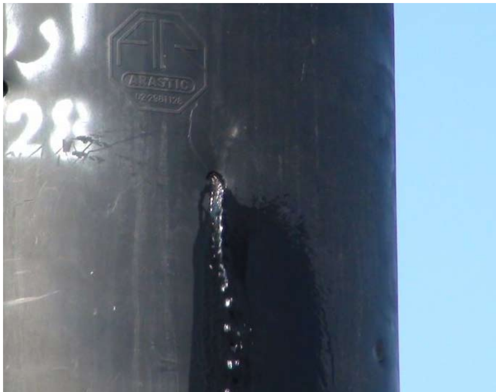
Water tank with a hole in it, a result of being struck by a tear-gas canister