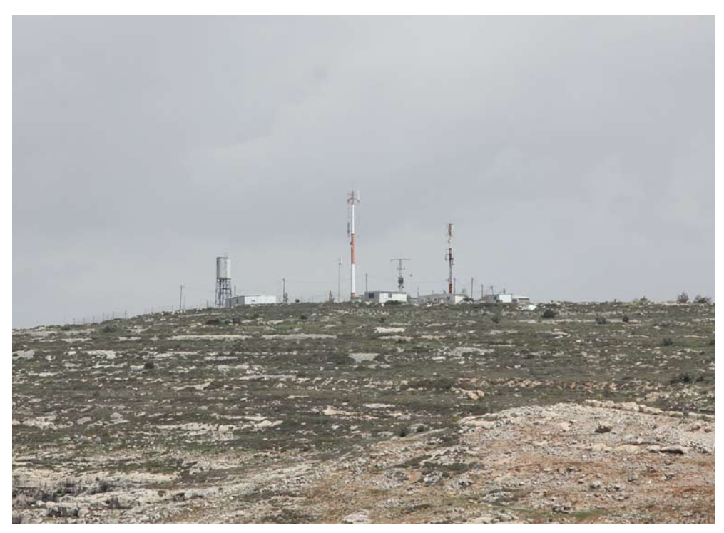
View of Migron from Burgah. Photo by Sarit Michaeli, B'Tselem, 30 March 2014.

pre-school, a synagogue and a ritual bath [ mikveh ]. According to the Sasson Report, up to the time the report was issued in 2005, the Ministry of Housing had invested more than NIS 4 million [approx. USD 1,176,470] in state funds in Migron.<sup>37</sup>