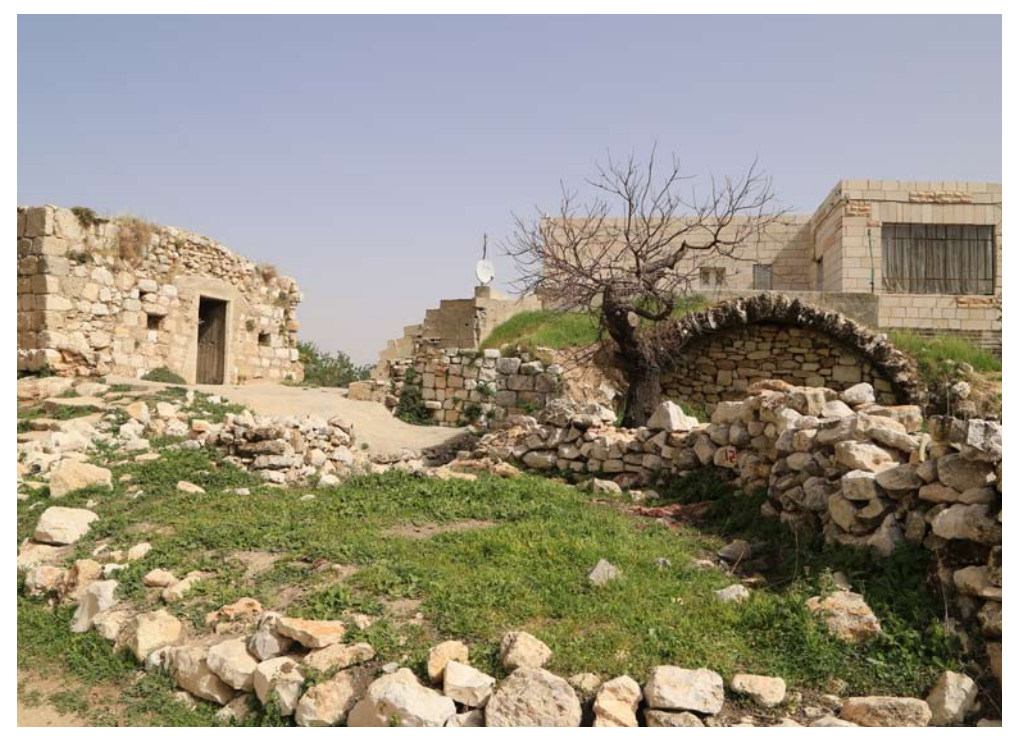
Remains of Ottoman Era homes in the center of the village, Al-'Alali Group.

sought other sources of income, such as exporting olive oil to Jordan, Syria and Lebanon.<sup>9</sup> Trade with Jordan continued after Israel occupied the West Bank in 1967 as part of Israel's Open Bridge Policy, albeit on a much smaller scale.<sup>10</sup>