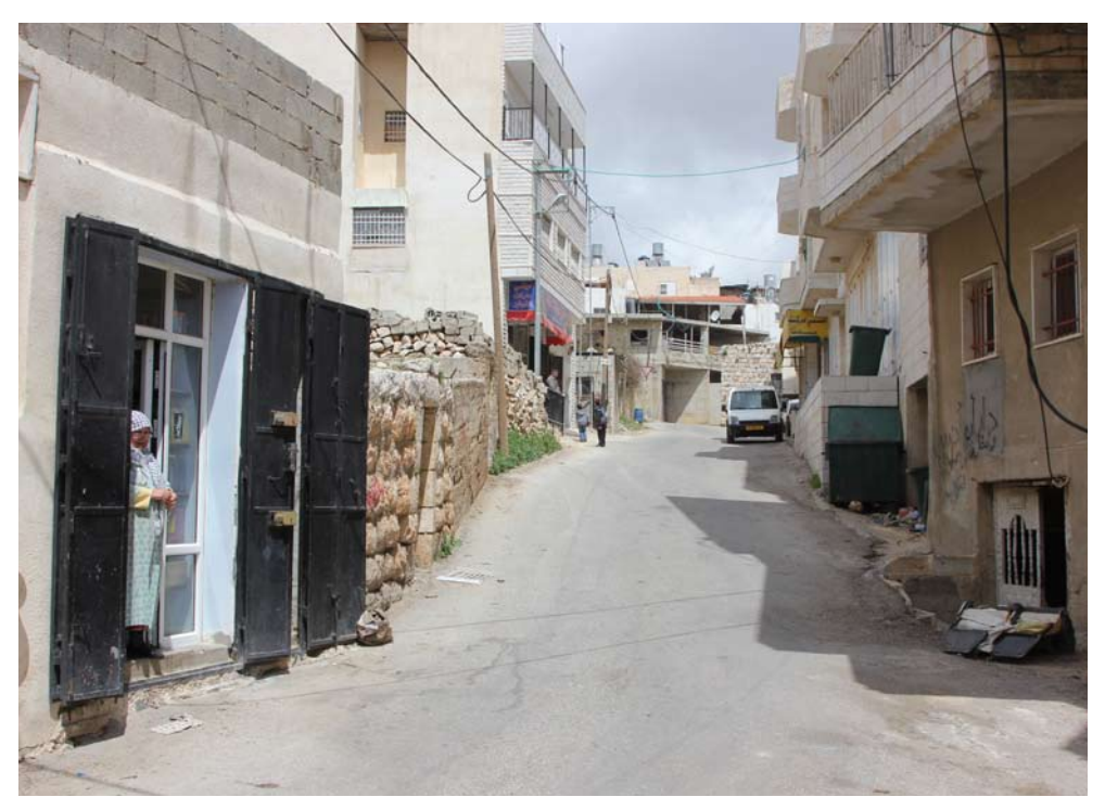
Burgah's main street. Photo by Osnat Skoblinski, B'Tselem, 30 March 2014.

I live with my parents and three siblings in a small, two-story building. We had no choice but build the second floor on top of an old structure my father had built on a small, 250-square-meter plot in the village center. We can't build anywhere else, although we have a lot of land in the village, because it's all either outside the boundaries of the master plan or in Area C, where Israel doesn't allow construction. So we live squashed like sardines, on top of one another. It's not just my family. The same is true for all the villagers here. There's no yard around the house where the children can play. There's no garden, no flowers, no plants. All around you see only buildings. The view is so depressing. 62