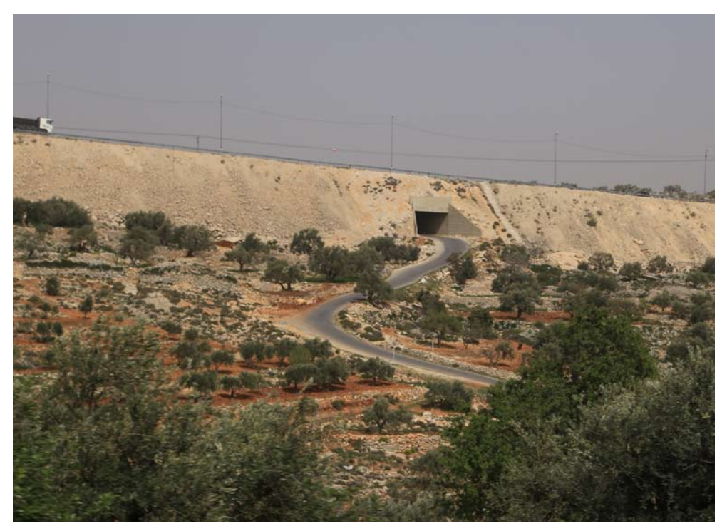
Route 60 cuts across olive grove. Photo by Sharon Azran, B'Tselem, 6 March 2014.

About 6 hectares of Burqah land were used for the road itself, or covered with dirt in order to build it. The remaining 3.2 hectares that had been expropriated, but ultimately not used for the road, continue to be used by their original owners, though officially they no longer have any rights to the land.