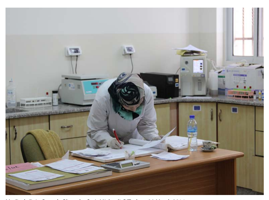
Medical clinic, Burqah. Photo by Sarit Michaeli, B'Tselem, 30 March 2014.

In a small village like Burqah, there are lots of problems. The biggest problem people have is the financial one, which leads to many other societal problems. Most of the women who come to the clinic suffer from various conditions because of lack of health awareness. This can be seen in the way they handle their children when they have a high fever, for example, or diarrhea. My profession is a humanitarian one and I have to give more than just medical assistance, I offer any other assistance I can, even if it's simply listening to the women.<sup>99</sup>