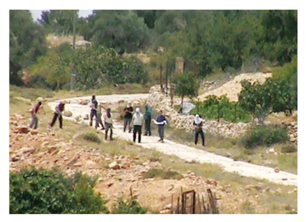
Settlers throw stones after entering village on Friday 6 June 2014.

Village residents also hesitate to arrive at their land located near the Migron outpost, where there is still a constant settler presence, despite the relocation of