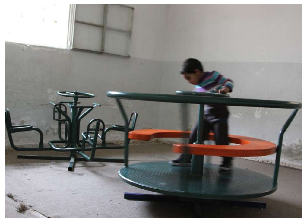
Playground equipment, Burgah pre-school. Photo by Osnat Skoblinski, B'Tselem, 30 March 2014.

with playground equipment donated by the council and installed this year. There is also an outdoor playground with old structures. Some are broken. The building is run-down. Window frames are broken, the paint is chipped and peeling, the furniture is outmoded and some of the chairs are too tall for the children. In Burqah, as in other pre-schools in the PA, children begin their literacy learning in kindergarten, and they sit at desks. The classrooms are very crowded, and some of the seats can only be reached by climbing on top of the desks. The yard is very dirty, and a nearby goat pen causes bad odors. The pre-school's meager budget cannot support the purchase of new furniture or basic maintenance.