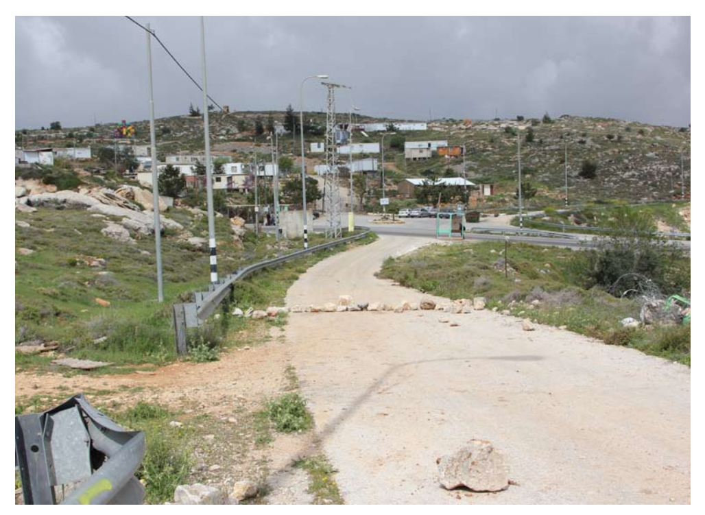
Stone obstacles placed on main road by Giv'at Asaf.

by the Ramallah DCO to the international community in July 2013 regarding the opening of another section of road near 'Ein Siniya, which stated that the trip from 'Ein Yabrud to Ramallah takes 45 minutes,<sup>21</sup> longer than timed by B'Tselem.