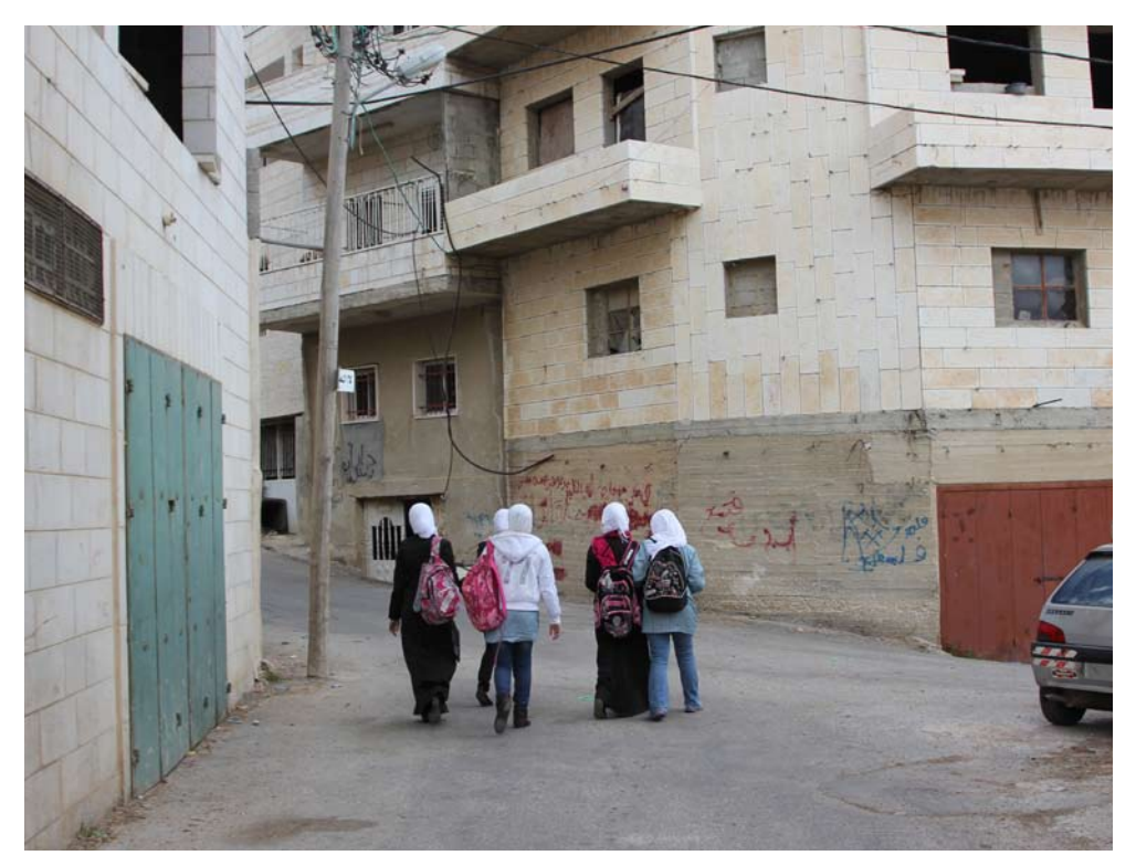
High school students on their way home from school. Photo by Osnat Skoblinski, B'Tselem, 30 March 2014.

The boys' high school has about 200 male students, and an additional 16 female students, majoring in science, which is not offered in the girls' school. The school