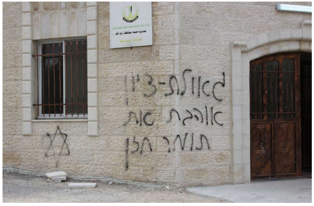
Graffiti spray-painted on a-Nur Mosque. Photo by Sarit Michaeli, B'Tselem, 30 March 2014.

Mosque, was targeted twice: graffiti and arson on 15 December 2011, and graffiti on 10 October 2013. Three cars were set on fire inside the village on that date as well.