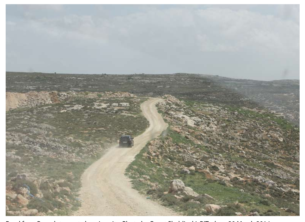
Road from Burqah to waste burning site. Photo by Osnat Skoblinski, B'Tselem, 30 March 2014.

Waste collection is the responsibility of the elected Burqah village council, which hires a contractor to do the work. Until this arrangement was instituted, garbage either piled up in the village, or was dumped by residents into the nearby valley. Now, a waste collection truck with two employees comes by twice a week, on Tuesdays and Saturdays. The portion of the village located in Area B cannot accommodate a landfill, and for the past twenty years, waste has been transported to a site located 1.5 kilometers south-east of the village, on about three hectares of Area C land, which was donated by its owner to help resolve the village waste problem. The site is in an Israeli-controlled area and at times, according to no particular schedule, inspectors come by and demand the waste be moved to the valley. This constitutes Israel's only involvement in this sphere, but the residents have no other solution. One way in which they attempt to meet the inspectors' demand is by burning the waste at the site. The waste is not buried in accordance with required standard procedure, and it produces a stench, gives off smoke and attracts insects.