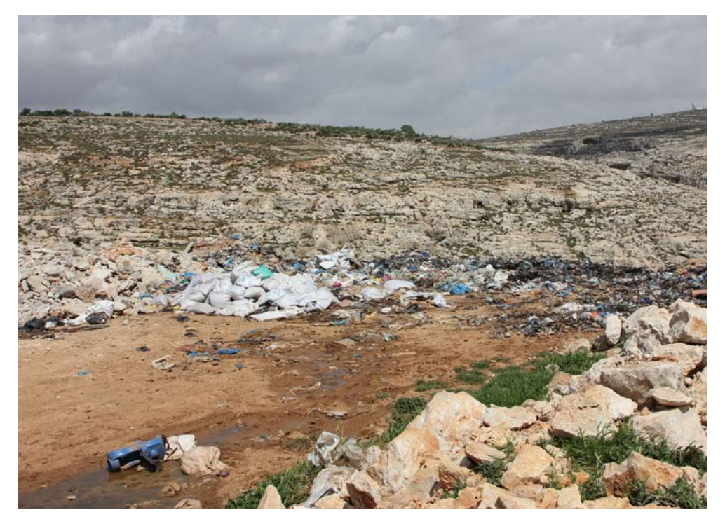
Waste burning site. Photo by Sarit Michaeli, B'Tselem, 30 March 2014.