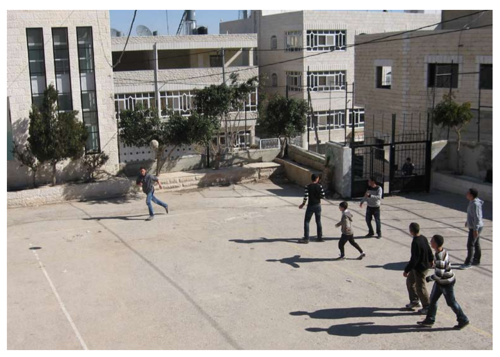
School yard, Burqah's boys high school. Photo by Naama Baumgarten-Sharon, B'Tselem, 5 February 2014.

Before Israel closed Burqah's access roads in 2000, many high school students attended school in nearby villages, particularly if they wanted to major in areas not offered by the boys' school in Burqah. Today, there are only thirty such students: students pursuing humanities attend school in Beitin and those pursuing industrial studies do so in Deir Dobwan. Though these villages are close to Burqah, students sometimes have difficulties reaching their schools because of road blockages. This is particularly problematic during exams.