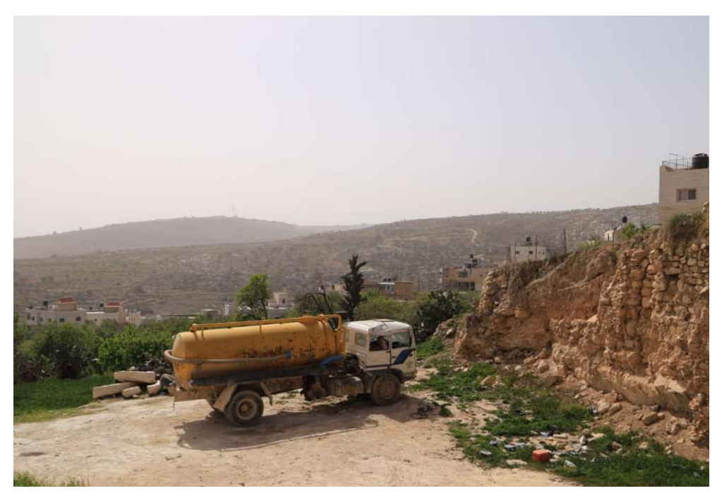
Sewage removal tanker, Burqah. Photo by Sharon Azran, B'Tselem, 6 March 2014.

Burqah is no different from other villages in the West Bank, almost none of which have proper sewage treatment.<sup>76</sup> One reason for this is that here too, Israeli approval is required. Inevitably, any sewage network must pass through Area C, and there is hardly any space for building a sewage treatment facility in Areas A or B.